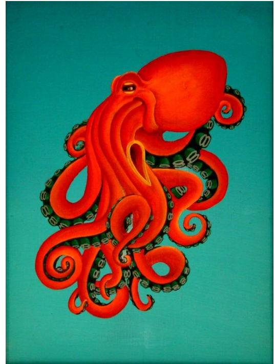
Gary Figg Menacing Octopus