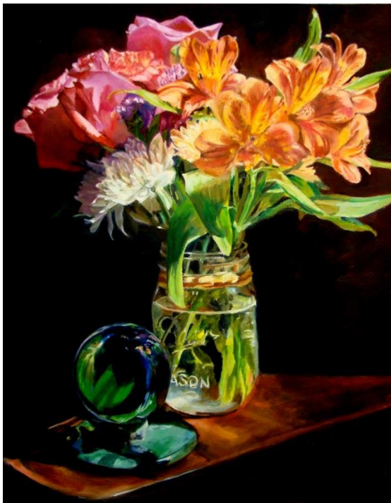
Rhonda Hughes The Witch Is Home