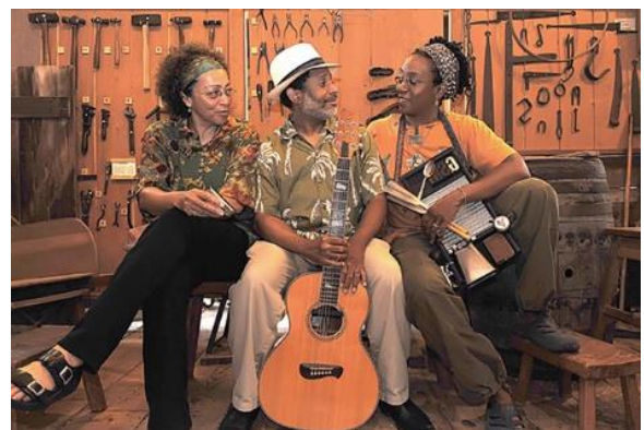
M.S.G. Acoustic Blues Trio